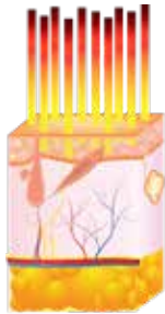
Figure: Er:YAG 2940 Fractional Mode: Micro Beams

The fractional effect is caused by a laser beam that delivers a powerful 2940nm wavelength. The wavelength is directed through unique optics that split it into multiple beams, known as pixels. The beams are arranged in two matrices- 7x7 (49 pixels) or 9x9 (81 pixels).